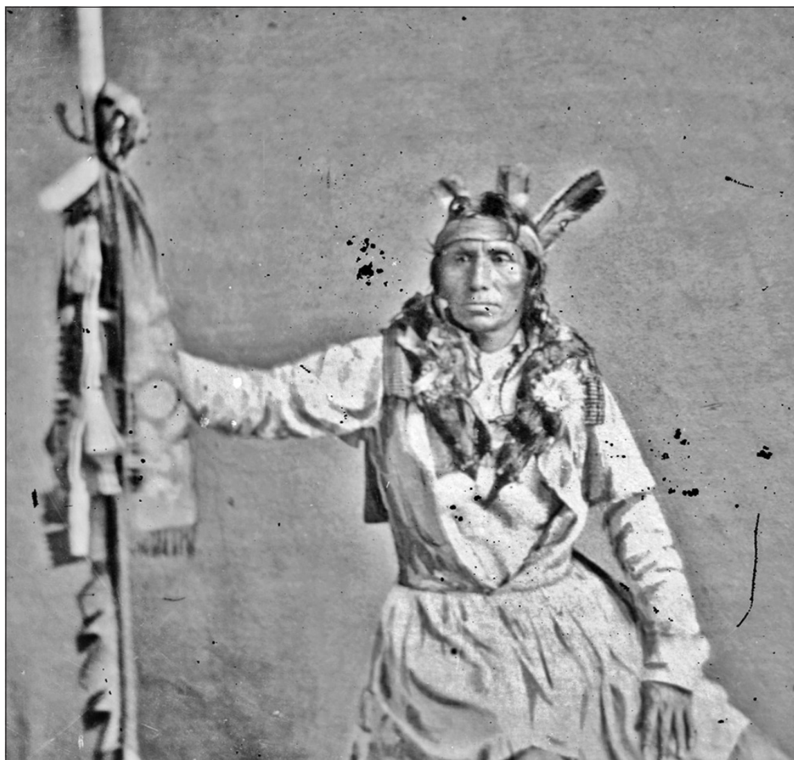
Little Crow was born about 1810 in Kaposia along the Mississippi River near St. Paul.