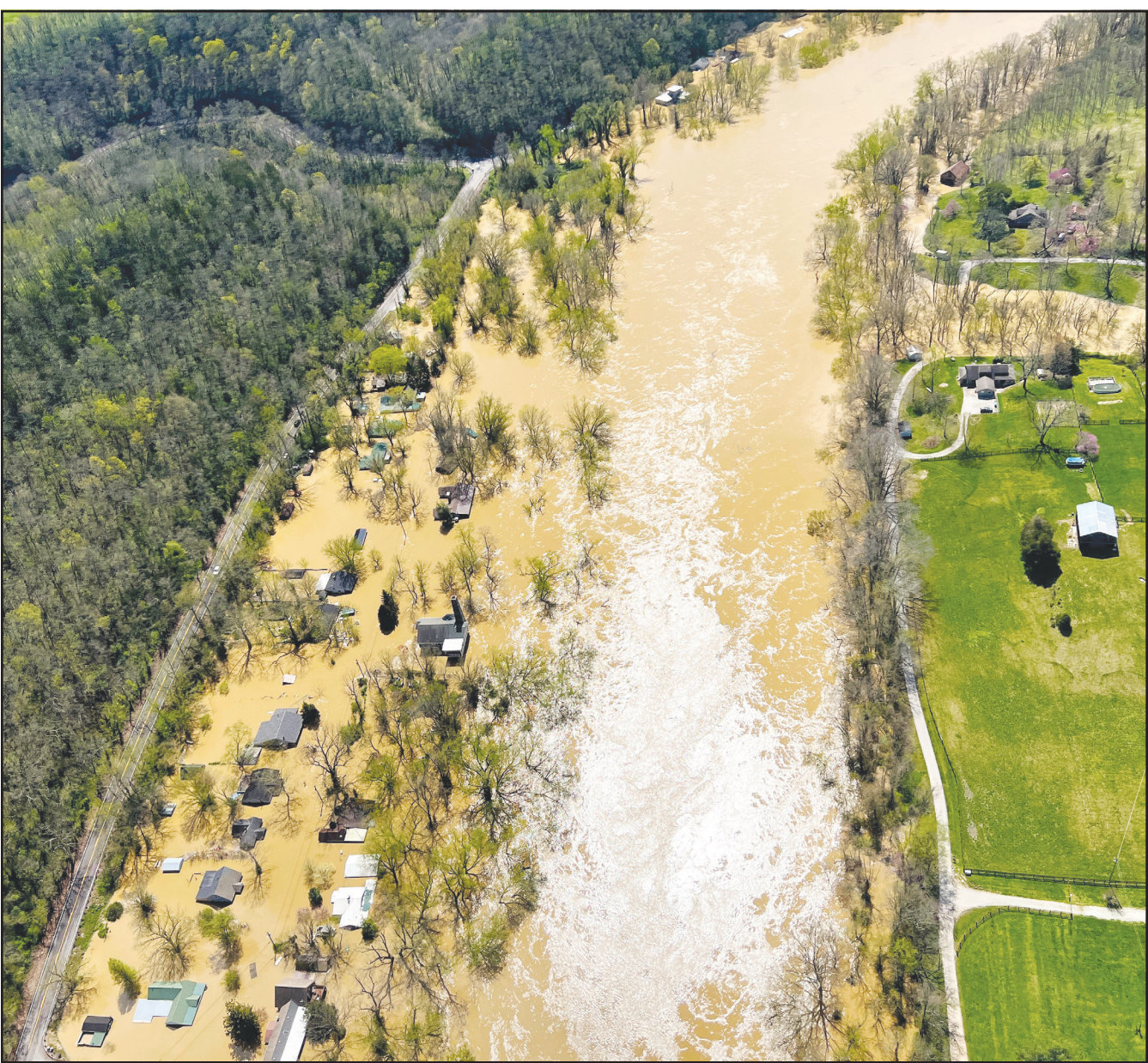
AERIAL PHOTO from the Kentucky National Guard flyover of the intersection of Clifton and Buck Run Roads.