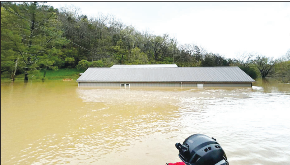
THIS STRUCTURE AT THE END OF SHRYOCKS FERRY ROAD was under water by Saturday morning. Firefighters from Versailles, Woodford County and other fire and rescue departments searched door to door in an effort to locate anyone who needed to be evacuated from their homes along the Kentucky River in Woodford County.