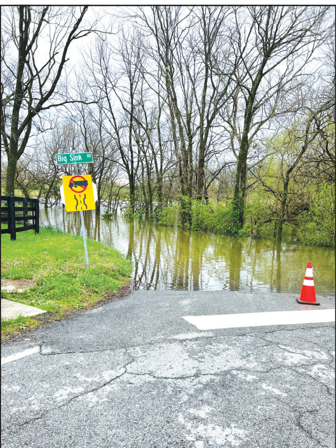
THE FLOODING was not limited to roads and structures abutting a creek or river. The intersection of Williams Lane and Big Sink Road was closed on Monday, April 7.