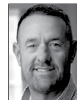
Chuck Geveden Guest columnist