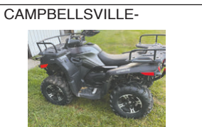
2021 C-Force Moto 600 4/4 Four Wheeler, approximately 900 miles like new condition. Asking $5,500. Call 270-299-6308