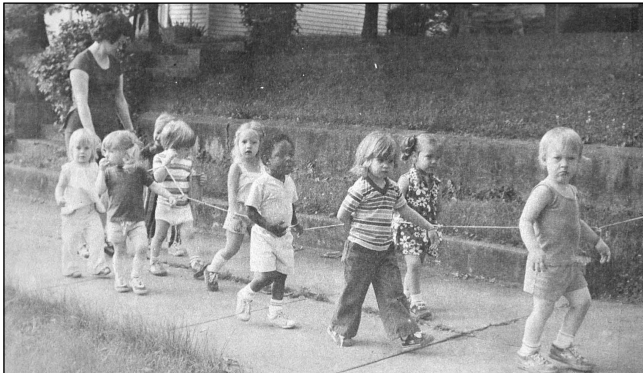
Stringin' along: These one- and two-year-olds from Childtown were taking a strole down Main Street. The photo was taken from the June 9, 1980 issue of The Sentinel-News.