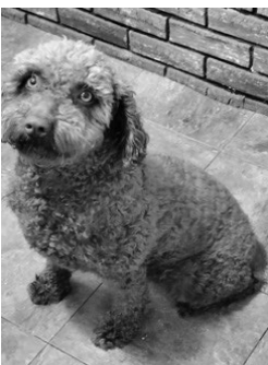
6 yr old female Spanish Water Dog

She needs a loving forever home. Lyla is in need of a new home because the owner has some health issues and is no longer able to care for her.