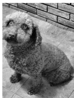
6 yr old female Spanish Water Dog

HORSE BRANCH: Puppies for sale. Yorkie Pups Small (3mo) $600 Male Toy Poodle (3yr) $100 All OTD Omahs (270) 775-3883