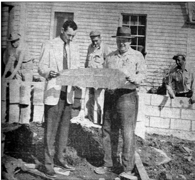
Western Ky. Gas new office erected.