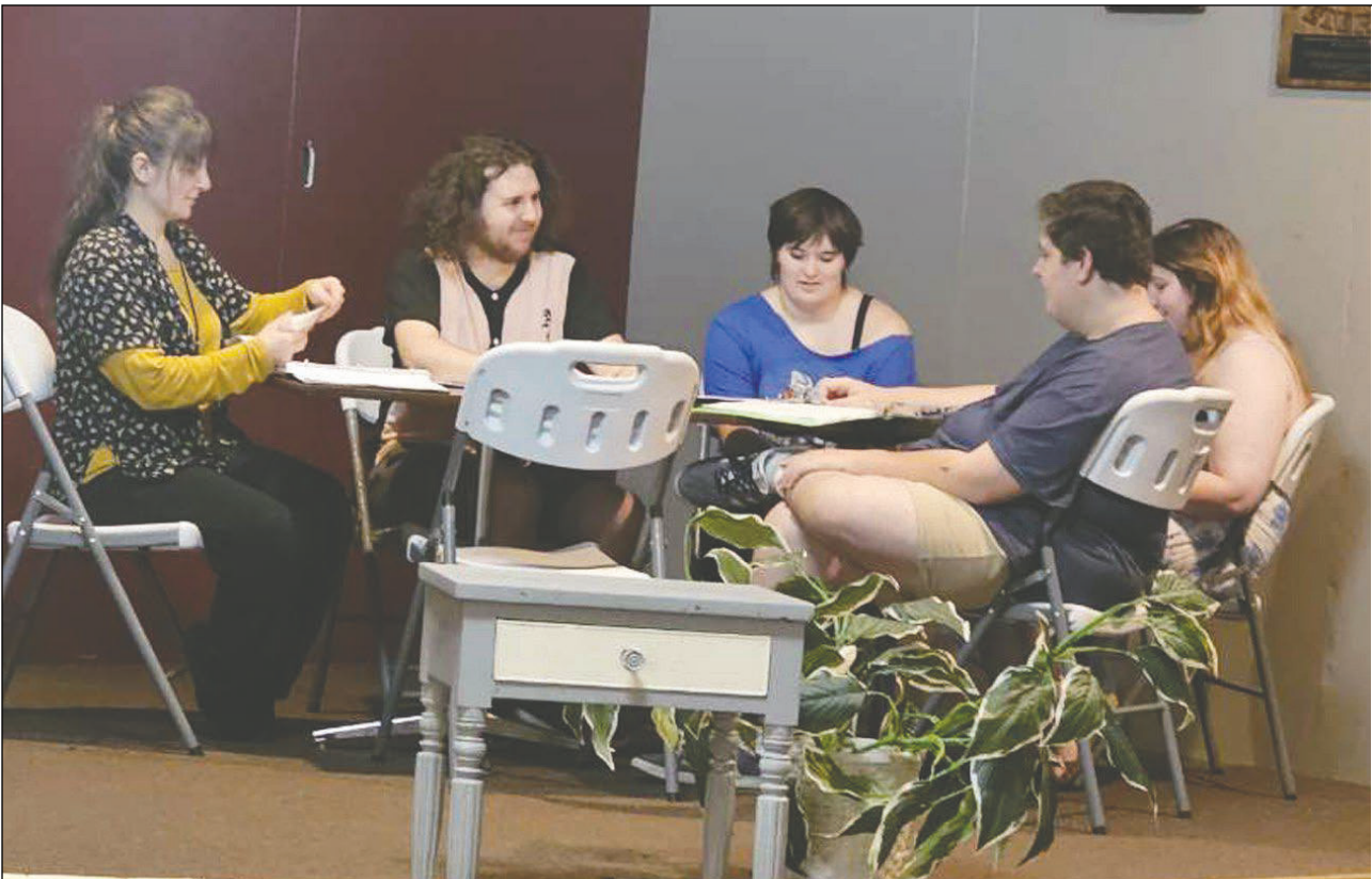
A few of the cast of “Nutty by Nature” do a read-through on the VFW Post 10281 stage, preparing for a 6 p.m. show Saturday.

WEDNESDAY AUGUST 13, 2025 • SERVING HARDIN COUNTY SINCE 1974 • REACH SUBSCRIBER SERVICES AT 270-505-1770 • $2