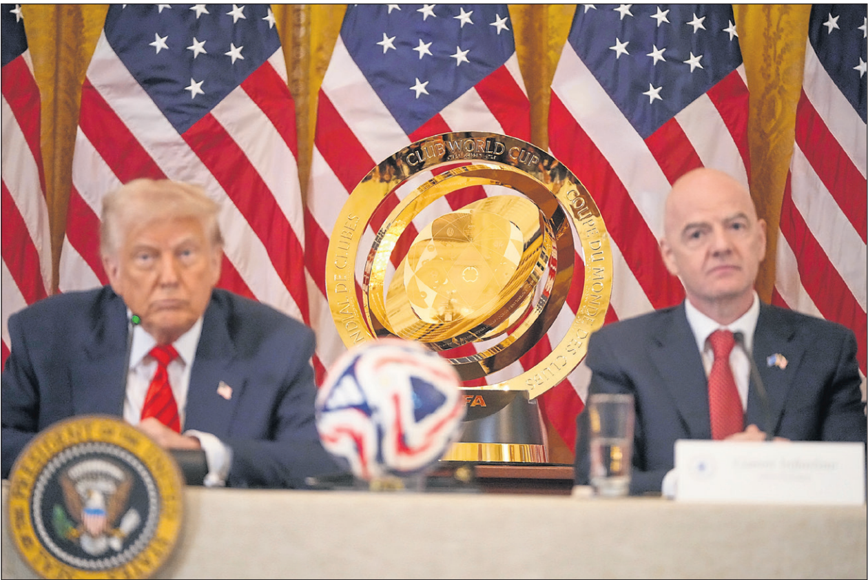
The FIFA club World Cup trophy sits between President Donald Trump and FIFA President Gianni Infantino during a FIFA task force meeting on the 2026 FIFA World Cup in the East Room of the White House on May 6, in Washington.

GENEVA — FIFA took another Saudi Arabian investment Thursday for the U.S.-hosted Club World Cup, announcing a top-tier commercial deal with the kingdom’s sovereign wealth fund, which holds majority ownership of one of the 32 teams playing. The Saudi state’s Public Investment Fund (PIF) is the 75% owner of Riyadh club Al-Hilal, one of four teams in the national league it has controlled since 2023. PIF also created the LIV Golf project. FIFA said PIF was an official partner of the June 14-July 13 tournament being played in 11 American cities, though the value of the deal was not stated. Saudi state money also is effectively funding the Club World Cup broadcasting deal that has largely backed the $1 billion tournament prize fund being shared among the 32 teams, including Al-Hilal, which will get an