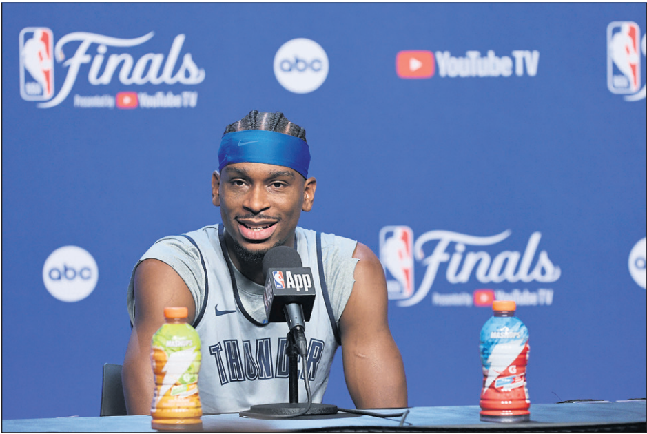
Oklahoma City Thunder guard Shai Gilgeous-Alexander speaks during a news conference on Wednesday, ahead of Game 1 of the NBA Finals basketball series against the Indiana Pacers in Oklahoma City.

homa City, along with Benedict Mathurin and Andrew Nembhard for Indiana. “I played against Andrew when I was 9 years old,” Gilgeous-Alexander said. “It’s been an amazing journey. To see him having success, my own success, obviously Lu’s success, Ben’s success, it’s special. It’s hard to even wrap your head around. ... For us to make it to this stage, is a testament to our hard work, our character, people around us that helped us get here. It’s been a blessing. It’s been super fun.” Dort said he hopes Canadians enjoy seeing four of their own in the finals. “Obviously we represent our teams here,” Dort said. “But at the end of the day we represent our country as well.” And it’s certain that Montreal will get a title: Dort and Mathurin are both from there. “I think it’s a great opportunity for me, Lu, the whole Montreal city,” Mathurin said. “I think it’s a great step in the right direction just to be able to go against each other. You know, Lu’s a great friend of mine. I would call him brother right now, but we’re enemies.” Finally, the finals, for James Johnson Indiana’s James Johnson has been in the NBA for 16 seasons. He has played for 10 different franchises. He has played under 11 different coaches. He has finally made the NBA Finals.