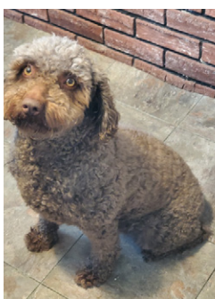
6 yr old female Spanish Water Dog

YOU MAY QUALIFY for disability benefits if you are between 52-63 years old and under a doctor's care for a health condition that prevents you from working for a year or more. Call now! 1-833-641-6772