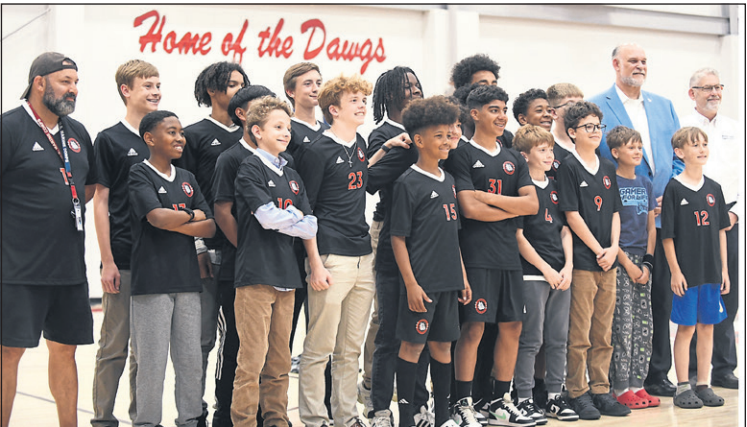
The new Bluegrass Middle School boys’ soccer team poses for a picture Thursday afternoon in the school’s gym.

school-sponsored middle school soccer club in Hardin County Schools. “Whereas men’s and women’s soccer continues expanding in our commonwealth and our Hardin County area, whereas the parents and guardians of Hardin County SEE SOCCER/PAGE B3