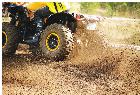
Kentucky Senate Bill 63 would bring registered off-road vehicles to highways