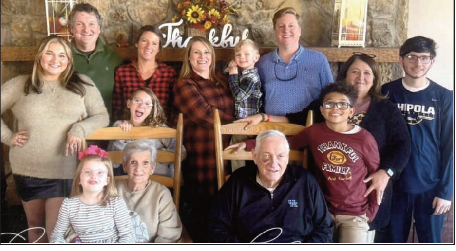
LEWIS COUNTY HERALD

Under the Beshear-Coleman administration, the state has broken its job-creation record, creating more than 60,000 good jobs. And while Kentucky has reached the highest point ever for the number of people employed, number of jobs filled and civilian labor force, the Governor and Lieutenant "American families are Governor believe there is still