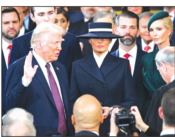
President Donald Trump