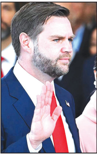
Vice President J.D. Vance