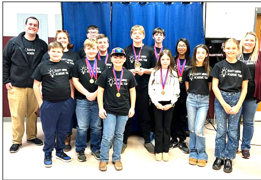
Elliott County Middle School Academic Team

The team also received the Hume Sportsmanship Award for outstanding sportsmanship, ethics, and spirit of friendly