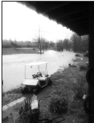
East Tunnel Hill Road - Submitted by David R Leach