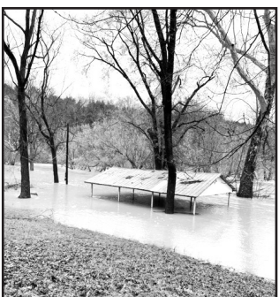
Owingsville Lions Club Park