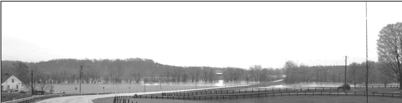
Photos submitted Photo by Cecil Lawson Slate Creek swelled beyond its banks on Friday and Saturday at the US 60 bridge east of Owingsville during four straight days of rain last week.

By Cecil Lawson KyNewsGroup cecil@kynewsgroup.com