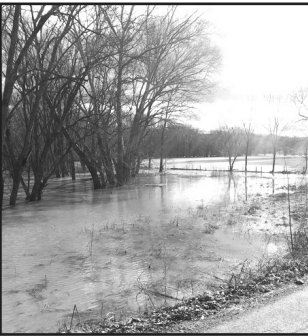
See's Branch and Slate Creek