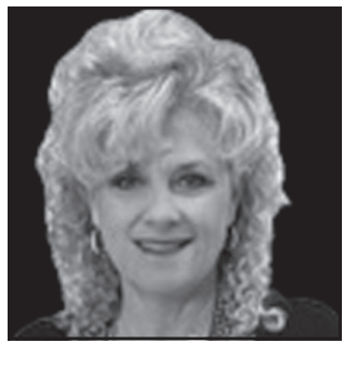
By: Sherry Brown

Hello Conway Here I go with more scheduled trips filled with days of flying domestically was my assignments out of my Detroit (DTW) base and that was the sweetness of my flight attendant career and I loved it so with the international waters and foreign countries below my aircrafts as well. Whether domestic or international trips I welcomed them all with excitement and my God given assignments were always filled with the wonderment of heaven and the beauty of His accomplishments within my spiritual being. I must say I've had thousands upon thousands of glorious assignments with souls globally. I loved impacting the hearts of my customers one flight at a time. I was born to fly and I loved it dearly! It was so exciting to experience every new day at the Air-